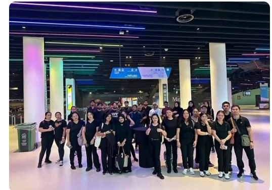
UFC Staffing and Merchandising