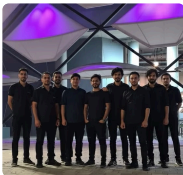
Hazza Bin Zayed Stadium catering sales