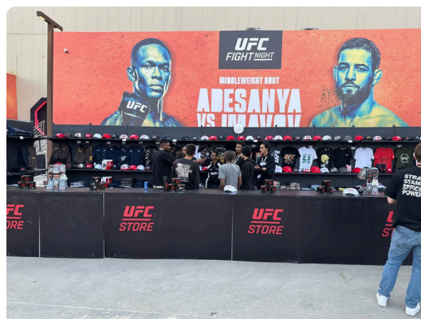
UFC Fight Night, Merchandise Sales