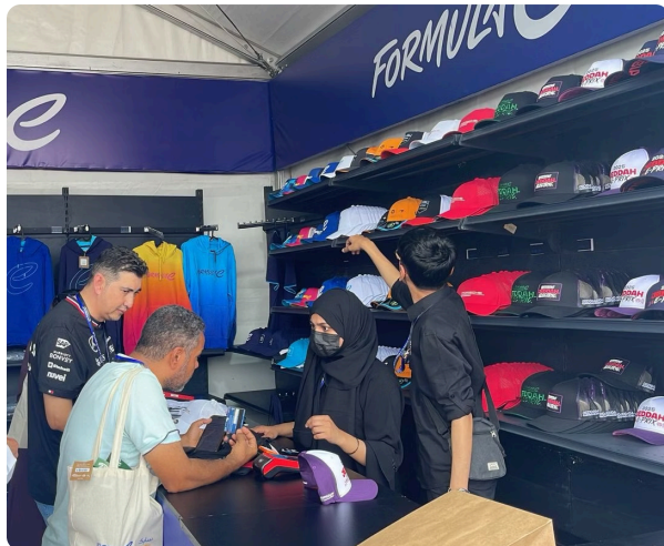
Formula E Merchandise Sales