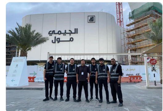
Al Dar Iftar Package Distribution (50+ Locations)