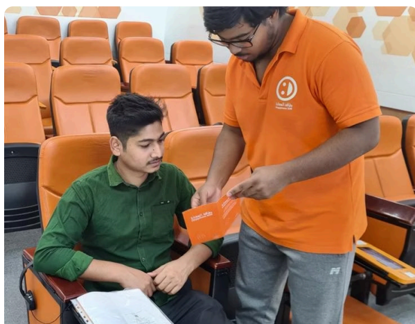
ALO MOHRE SIM Campaign (7+ Locations)