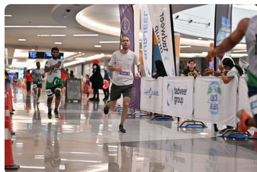
Dalma Mall challenge run